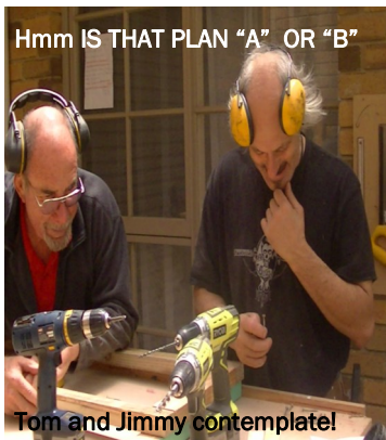
Hmm IS THAT PLAN "A" OR "B"