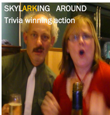
SKYLARKING AROUND Trivia winning action