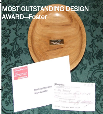
MOST OUTSTANDING DESIGN AWARD—Foster